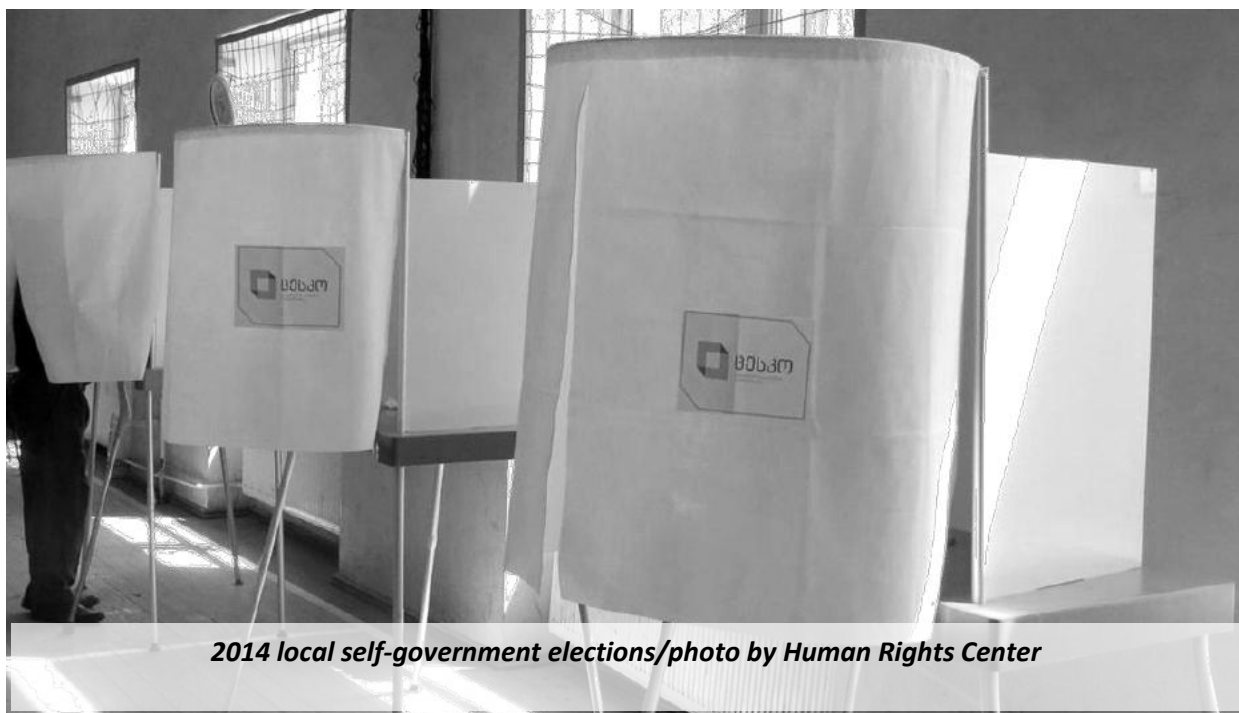
2014 local self-government elections